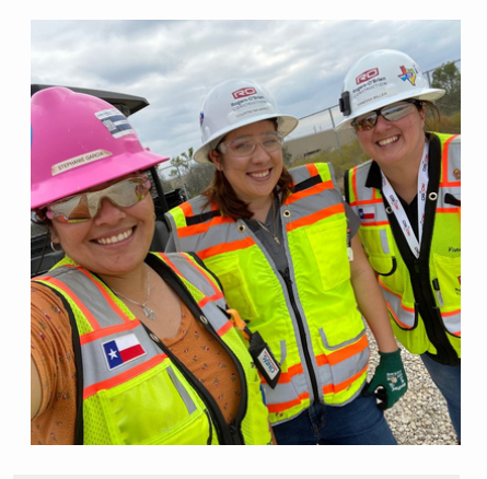
Hawaii Dredging Tours