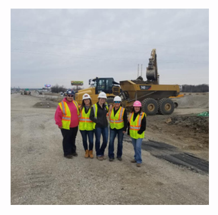
Rogers -O'Brien Construction Jobsite Tour - The Cambria Hotel