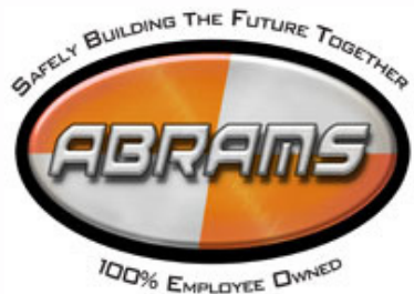
ONE TEAM, ONE COMPANY