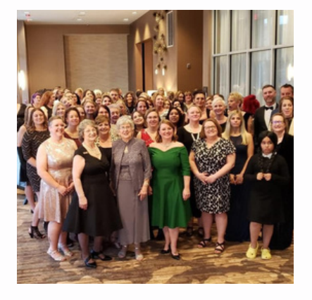
NAWIC WPB Circus Casino Night