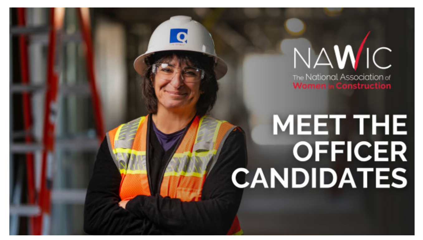
Meet the candidates March 30th at 6pm via Zoom! Learn More...